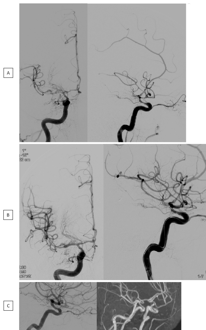
Figure 2 Angiogram before (A) and after (B) TBA with a CB in connection with severe CVS in the distal ICA as well as within the proximal segments of the MCA and ACA. Mild arterial narrowing in the catheter angiography and TOF MRA, 6 months later (C). ACA, anterior cerebral artery; CB, compliant balloons; CVS, cerebral vasospasm; ICA, internal carotid artery; MCA, middle cerebral artery; TBA, transluminal balloon angioplasty; TOF MRA, time-of-flight magnetic resonance angiography.

treated arteries. Umeoka et al analysed 32 patients who underwent successful TBA for CVS; however, only NCB was employed in this study. 10 These patients underwent follow-up via CT angiography (CTA) and MRA with a follow-up range of 6 to 126 months and a mean of 12 months; restenosis were not detected in any patients.