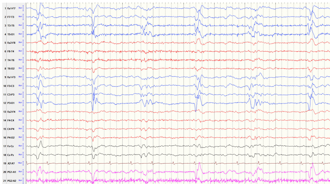
Figure 1 Lateralised periodic discharges (LPDs, formerly known as periodic lateralised epileptiform discharges). The EEG showed left side LPDs recurring at 0.5 Hz (discharges per second) with focal slowing in the same area. This EEG was obtained from a 61-year-old woman with left middle cerebral artery infarct and one-time generalised tonic-clonic seizure.

The value of interictal epileptiform abnormalities in predicting epileptic seizures or SE is still not clear. Interictal epileptiform abnormalities represent focal cortical irritation; among them, LPDs may be an expression of dynamic brain damage in the very acute stage and they increase the potential for developing seizures. In Mecarelli et al's study, 40 EEGs were performed within 24 hours of admission and the patients were followed up clinically for 1 week. The authors found that none of the patients with focal or diffused slowing developed epileptic seizures; 85.7% of patients with LPDs developed seizures, and 13% of patients with other epileptiform abnormalities had focal seizures. Among the patients with LPDs, 71% with seizure developed into SE, 90% convulsive SE and 10% none convulsive SE. Koren and colleagues 52 in a small sample study found that in 23% of their patients, epileptiform discharges within the first 30 min of EEG developed into electrographic seizures, as shown in subsequent EEG. Multivariate analysis demonstrated that only early epileptiform discharge LPDs were independently associated with PSS. 53